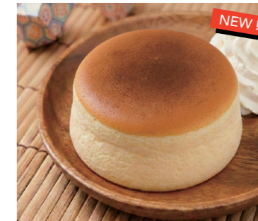
チーズケーキ Cheese cake €7.80 Light and fluffy Japanese-style cheesecake with a delicate texture.