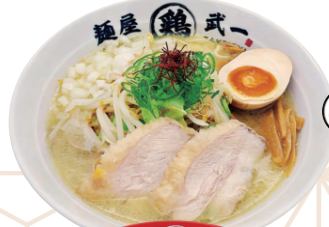
濃厚鶏白湯塩ラーメン Halal Deluxe Paitan Shio €17.60