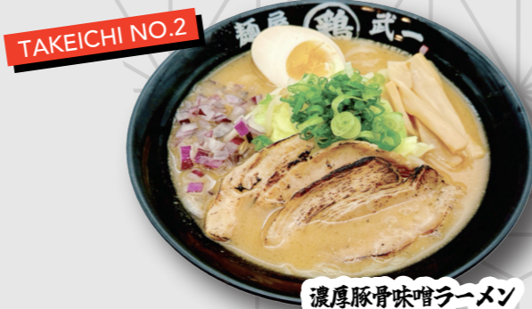
濃厚豚骨味噌ラーメン Deluxe Tonkotsu Miso €19.80

Cabbage & Bean sprouts , 1 Half Egg , Green Onion, Red Onion, Bamboo shoots , 1 Nori (Only Shoyu), 2 Pork Chashu