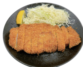
鶏カツ Chicken Katsu €8.90 Japanese Schnitzel. Slices Cabbage with Okonomi Sauce