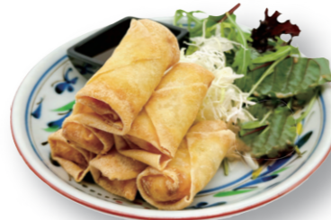
揚げ春巻き Loempia €8.40 Crispy spring roll with Sweet chili sauce