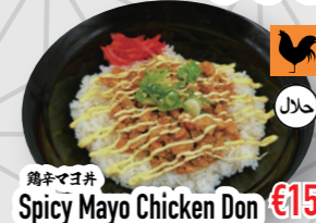
鶏辛マヨ丼 Spicy Mayo Chicken Don €15.30 Home Made Spicy Paste, Special Chili oil, Japanese Mayo Rice bowl