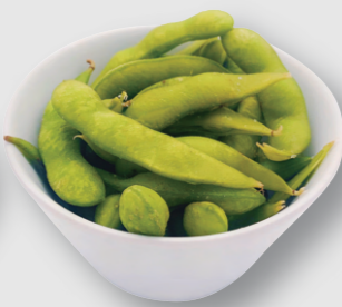
枝豆 Edamame €5.90 Boiled Soy Beans with Sea Salt