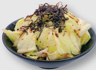
やみつきキャバツ Yamitsuki Cabbage €5.90 Cabbage & Shio konbu