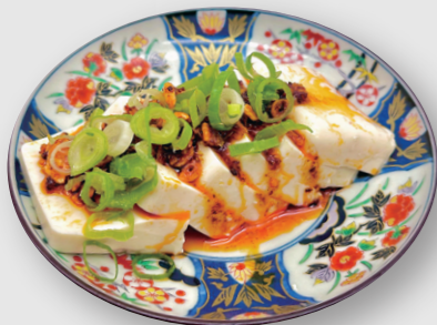
特製食ベラー冷奴 Chili Crisp Cold Tofu €6.90 Silky tofu topped with spicy chili crunch.