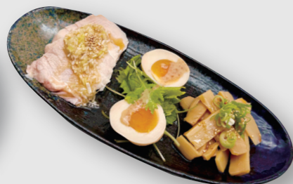
おつまみ三点 Otsumami €9.90 A Combination Of 3 Tapas / Sesame dressing (Chicken chashu / Ajitama Egg / Spicy Menma)