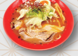
濃厚豚骨旨辛ラーメン Deluxe Tonkotsu Spicy €19.80