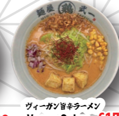
ヴィーガン旨辛ラーメン Vegan Spicy €17.30