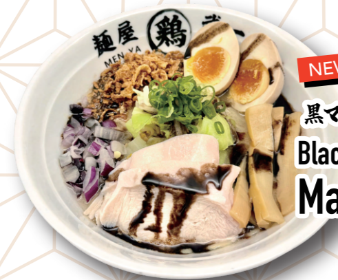
NEW !! 黒マー油鶏白湯ラーメン Black Garlic Chicken Ma-yu Paitan Halal €19.20

SHOYU : Soy Sauce Soup Base SHIO : Sea Salt Soup Base SPICY : Spicy Soup Base MISO : Fermented soybeans soup