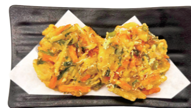
野菜かき揚げ Kakiage €6.60 Mixed Vegetable Tempura with Daikon oroshi & Tsuyu