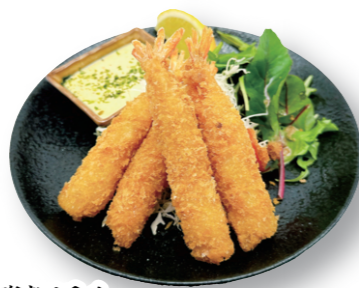
海老フライ Ebi Fry €8.90 Fried Breaded Prawn with Taru Taru sauce