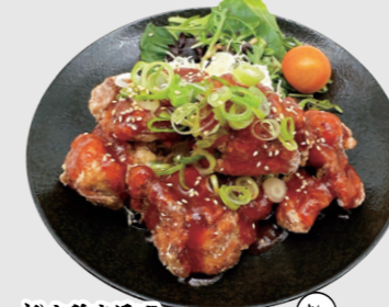
旨辛鶏唐揚げ Spicy Kara-age 5pcs 11.40 Kara-age With Home Made Sweet Chili Sauce