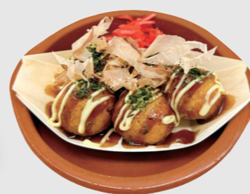
たこやき Takoyaki 5pcs 8.20 Okonomi Sauce & Japanese Mayonnaise

Takoyaki is ball-shaped Japanese snack made of wheat flour based batter with pieces of octopus inside.