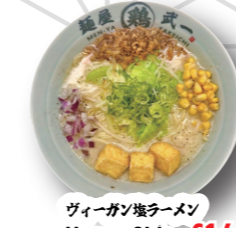
ヴィーガン塩ラーメン Vegan Shio €16.40