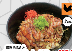
鶏照り焼き丼 Chicken Teriyaki Don €15.30 Grilled Chicken With Teriyaki Sauce Rice bowl