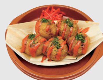
スパイシーマヨたこやき Spicy Mayo Takoyaki 5pcs 8.90 Home Made Spicy Mayo