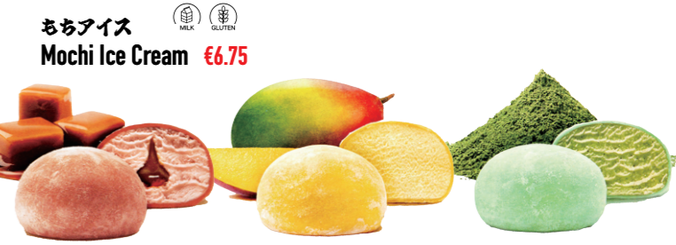
もちアイス Mochi Ice Cream €6.75 Caramel 2pcs Mango 2pcs ※Whipped cream is not vegan Matcha 2pcs

Traditional Japanese rice dough filled with smooth, creamy ice cream for a perfect balance of texture and sweetness, available in assorted flavours.