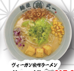
ヴィーガン味噌ラーメン Vegan Miso €17.30