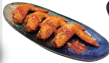
手羽先 Chicken wing €10.90 Crispy, golden-fried chicken wings infused with aromatic spices and a savory sesame crunch.