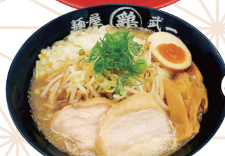
濃厚鶏白湯味噌ラーメン Halal Deluxe Paitan Miso €18.20