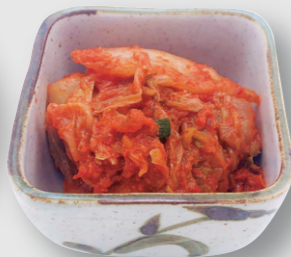
キムチ Kimchi €5.50 Pickled Spicy Cabbage