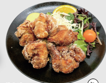
鶏唐揚げ Original Kara-age 5pcs 10.40 Original Japanese Fried Chicken

Kara-age is a dish that is made from marinated pieces of chicken that are fried, coated in special flour mix.