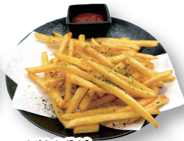
のりしおポテト Potato Fries €6.40 Japanese Aonori with Ketchup