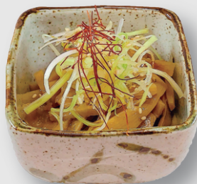
辛メンマ Spicy Menma €5.50 Spicy Bamboo Shoots