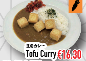
豆腐カレー Tofu Curry €16.30 Fried Tofu With Japanese Vegan Curry