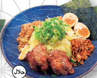
デラックススパイシーまぜそば Deluxe Spicy Maze men €19.80