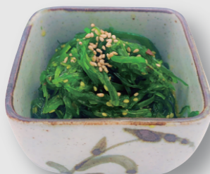
ワカメ Wakame €5.40 Healthy Marinated Seaweed