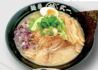
濃厚豚骨醤油ラーメン Deluxe Tonkotsu Shoyu €19.20