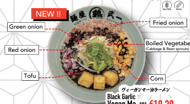
ヴィーガンマー油ラーメン Black Garlic Vegan Ma-yu €18.30

A creamy and flavorful vegetable broth made from a carefully selected blend of 10 vegetables and soy milk. Served with fresh toppings.