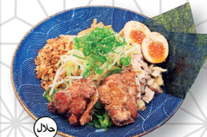
デラックスまぜそば Deluxe Maze men €19.40 Extra Maze men Noodles €3.00

Karaage 2pcs, Ajitama Egg, Bean sprouts, Cabbage, Green onion, Fried onion, Bamboo shoots, Nori 2pcs, Diced Chicken, Thick Noodles