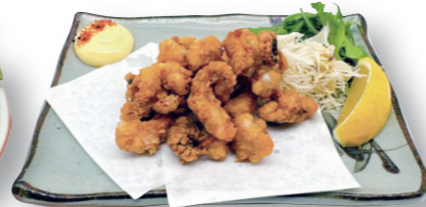
たこの唐揚げ Fried Octopus €10.60 Deep-fried octopus seasoned with spices, slightly spicy and crispy.