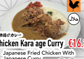
鶏唐揚げカレー Chicken Kara age Curry €16.30 Japanese Fried Chicken With Japanese Curry