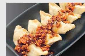
Fried dumplings With crunch chili パリ辛ぎょうざ €7.80 特製食ベラーがけ