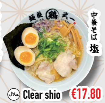
中華そば塩 Halal Clear shio €17.80