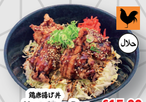
鶏唐揚げ丼 Kara age Don €15.30 Japanese Fried Chicken Rice bowl