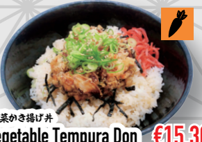
野菜かき揚げ丼 Vegetable Tempura Don €15.30 Vegetable Tempura Rice Bowl Daikon Oroshi & Tsuyu Sauce