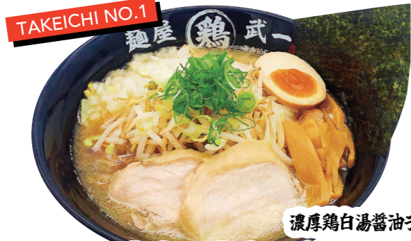
濃厚鶏白湯醤油ラーメン Halal Deluxe Paitan Shoyu €17.60

Cabbage & Bean sprouts , 1 Half Egg , Green Onion, Red Onion, Bamboo shoots, 1 Nori (Only Shoyu), 2 chicken breast chashu