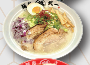
濃厚豚骨塩ラーメン Deluxe Tonkotsu Shio €19.20