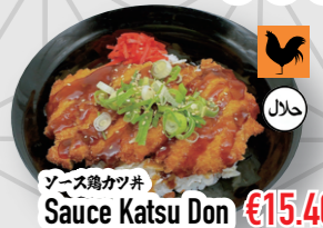
ソース鶏カツ丼 Sauce Katsu Don €15.40 Chicken Schnitzel With Okonomi Sauce Rice bowl