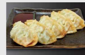
Fried dumplings With sweet chili sauce パリ辛ぎょうざ €7.20 スイチソース添え