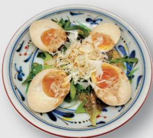
味玉盛り Ajitama mori €6.20 Soft Boiled Marinated Eggs Sesame dressing