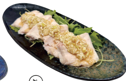
しっとり鶏むねのネギ塩仕立て Scallion shock Chicken €8.40 Tender Marinated Chicken Breast Fillet With Special Scallion Sauce