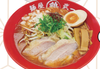
濃厚鶏白湯旨辛ラーメン Halal Deluxe Paitan Spicy €18.20