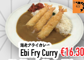
海老フライカレー Ebi Fry Curry €16.30 Fried Breaded Prawn With Japanese Curry