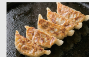
Pan baked dumplings With soy sauce 焼きぎょうざ €7.20 醤油ソース添え

Japanese-style dumplings. We offer three kinds of gyoza, please select either chicken or vegetable.