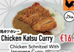
鶏カツカレー Chicken Katsu Curry €16.30 Chicken Schnitzel With Japanese Curry