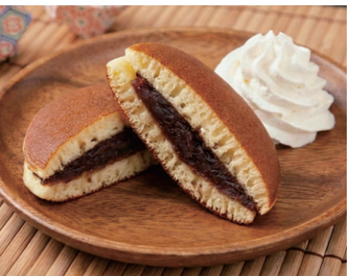
どら焼き Dorayaki €5.60 A classic Japanese dessert featuring sweet red bean paste sandwiched between two fluffy, honey-infused pancakes.