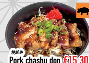
焼豚丼 Pork chashu don €15.30 Pork Slices With Garlic Teriyaki Sauce Rice bowl