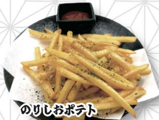
のりしおポテト Potato Fries €5.90