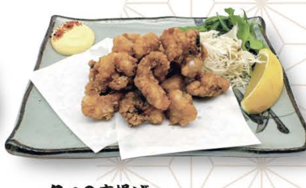
タコの唐揚げ Fried Octopus €10.20