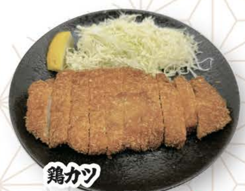
鶏カツ Chicken Katsu €9.80