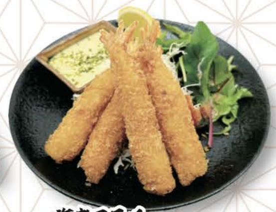
海老フライ Ebi Fry €9.80