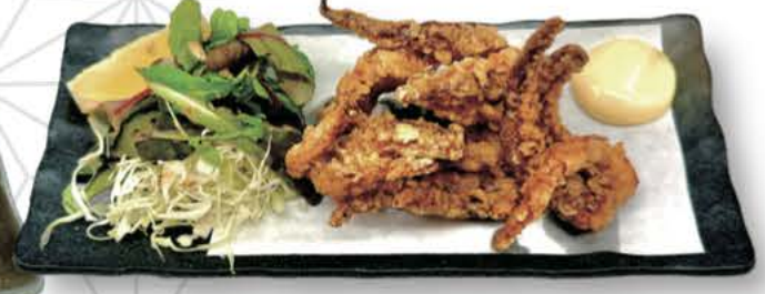
イカゲソ揚げ Squid tentacles €11.20

Squid tentacles, lightly prepared and commonly served as a chewy, flavorful dish.