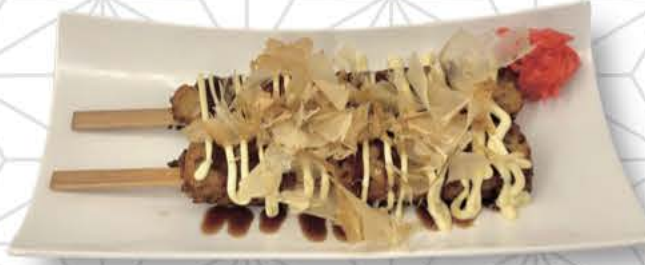
お好み焼きスティック Okonomiyaki stick €8.40

A handheld Japanese okonomiyaki, served on a stick.