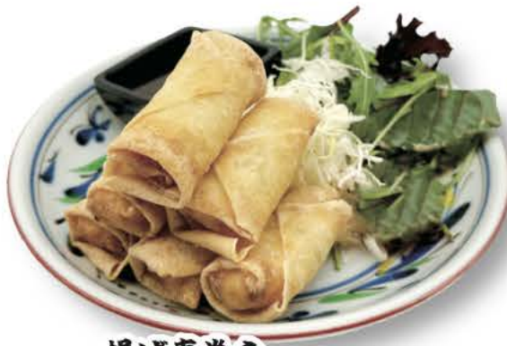
揚げ春巻き Spring Roll €8.20