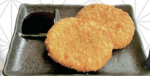
懐かしのコロッケ Japanese Croquette €7.50