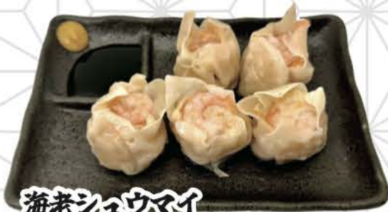
海老シュウマイ Steam Shumai €6.80

Juicy shrimp with a bouncy, springy texture and rich