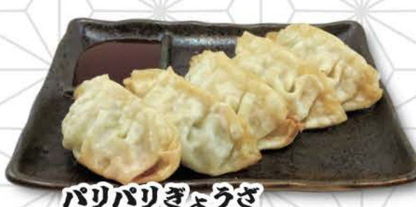
パリパリぎょうざ Crispy Gyoza €6.90