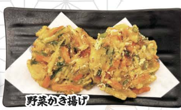
野菜かき揚げ Kakiage €6.40

Vegetable Tempura with Daikon Orosi & Tsuyu