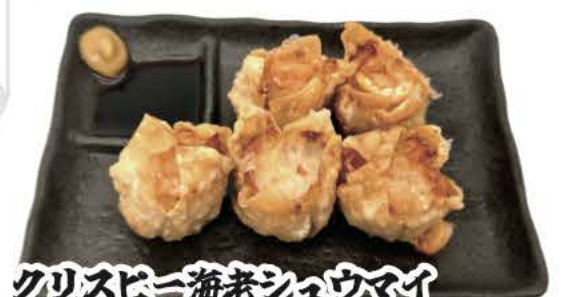
クリスピー海老シュウマイ Crispy Shumai €6.80

Golden-fried dumplings with shrimp inside and a satisfying crunch