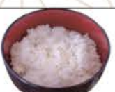
Medium €3.40 Large €4.20